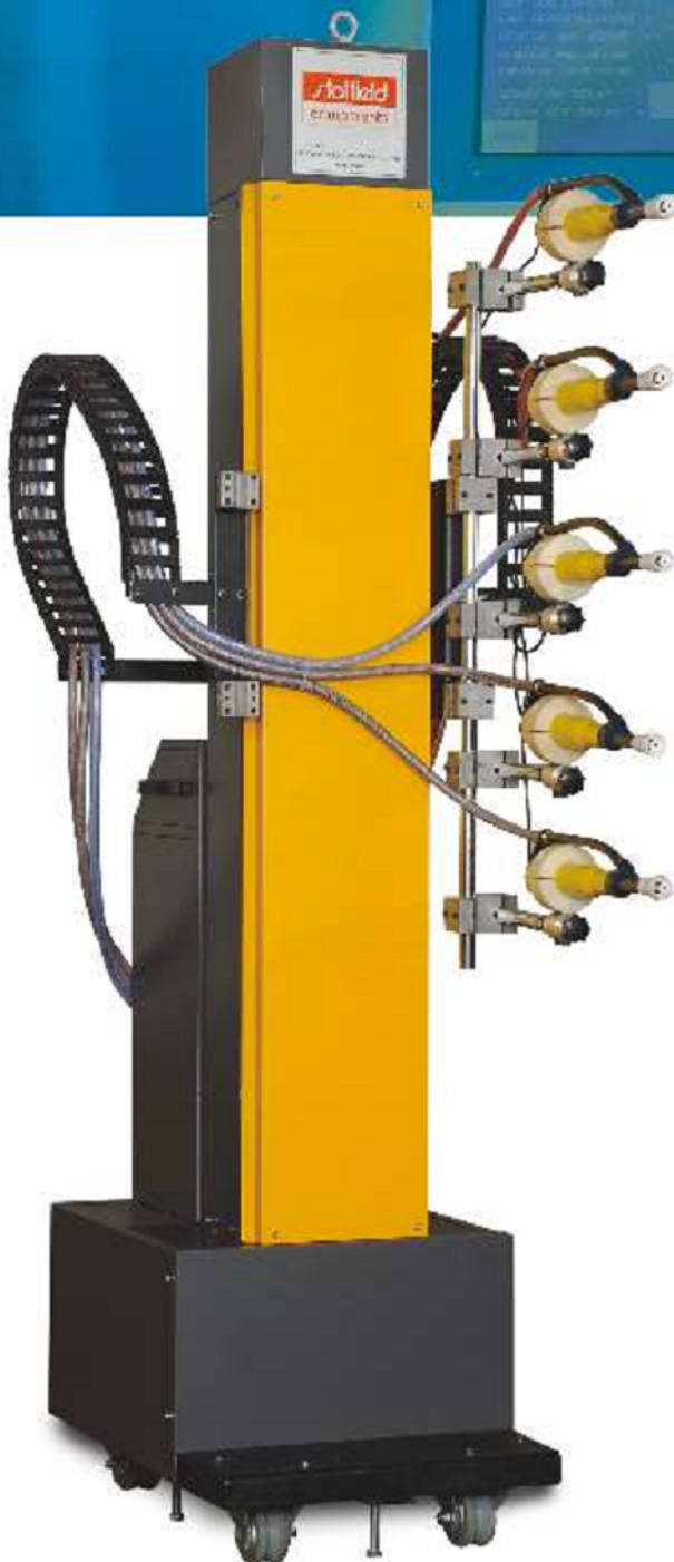
Reciprocator Model - EMR 8

The fully automated Statfield Reciprocator eliminates labour and saves time and power while achieving superior results for liquid painting.